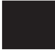
Matte Black TN900MB