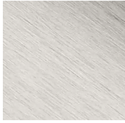
Brushed Nickel TN900NK