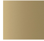
Brushed Brass TN900BB