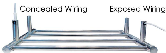
Universal Wiring Options

12mm Drill Hole required for Concealed Wiring